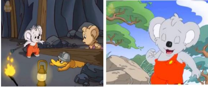
Figure 2. An Illustration of the Affordances of a Static Visual Narrative